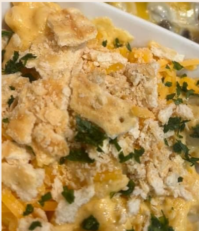
Mac & Cheese Entree